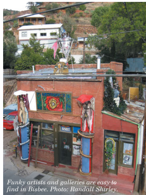
Funky artists and galleries are easy to find in Bisbee.