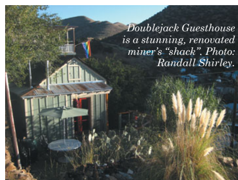
Doublejack Guesthouse is a stunning, renovated miner's "shack".