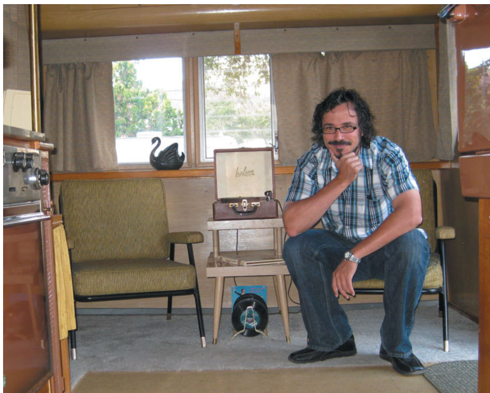
You can't hang out in a Bisbee, Arizona retro-trailer if you're scared of a border pat-down!

Blog with me at: www.randallshirley.com/blog